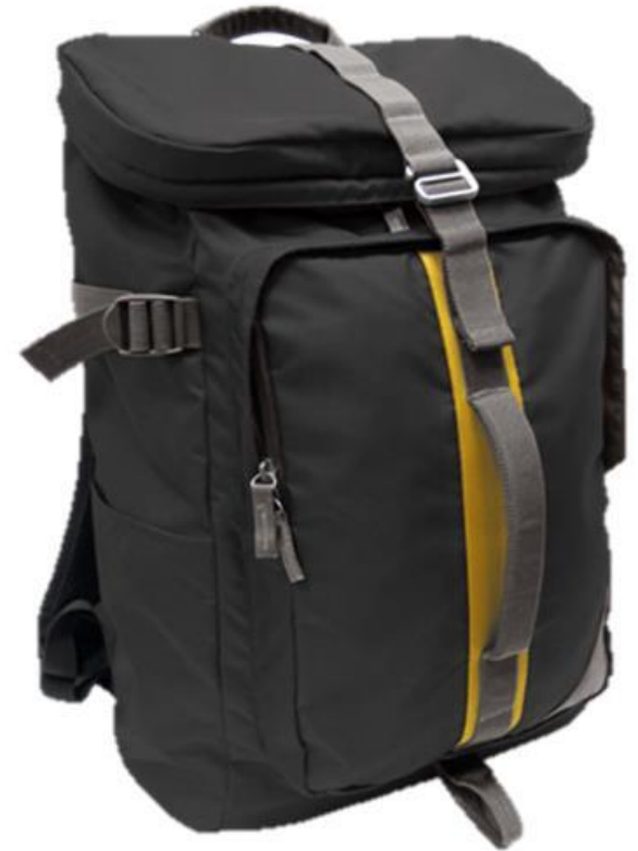
[ Black ]