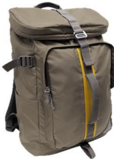
[ Khaki ]