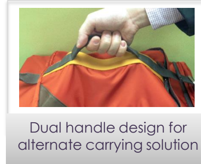
Dual handle design for alternate carrying solution