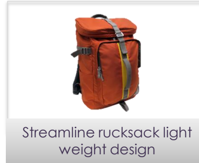
Streamline rucksack light weight design