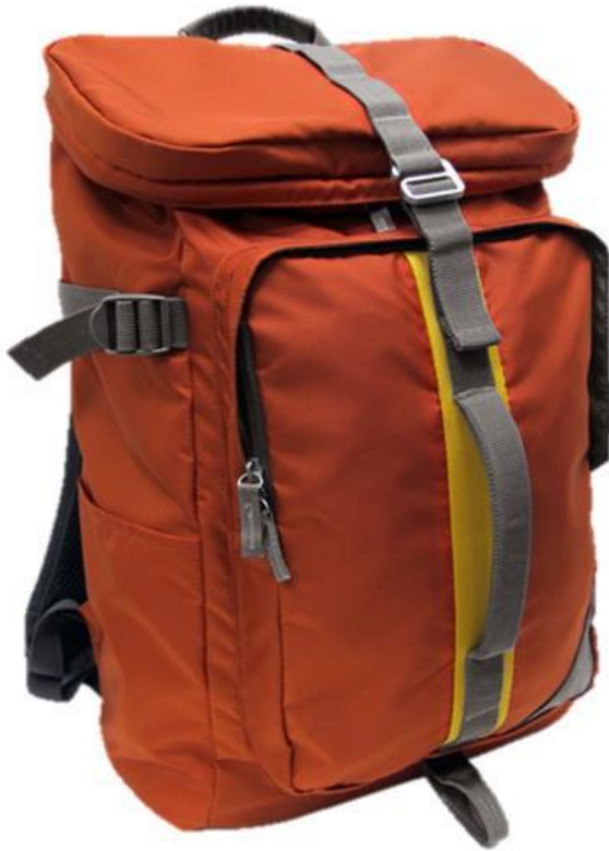
[ Orange ]